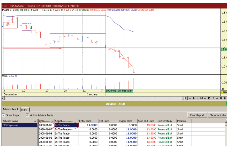
Example 2: Singapore Exchange Ltd: We spotted on 4 January 2008 for the class on 5 January 2008. Shorted at 11.90